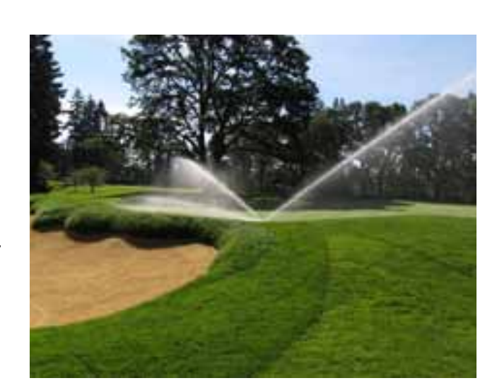
"We initially ordered 50 Profile nozzles and saw results within days. Profile nozzles improved distribution uniformity practically overnight. The soggy soft spots disappeared and the donuts greened up."

"Over the last couple years we've had our share of irrigation issues," says Kachmarek.